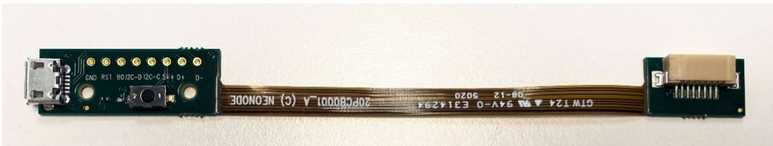
Figure 3: NNAMCIFB00002